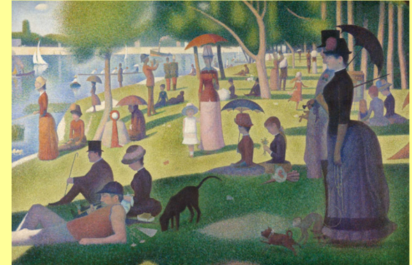
A Sunday on La Grande Jatte