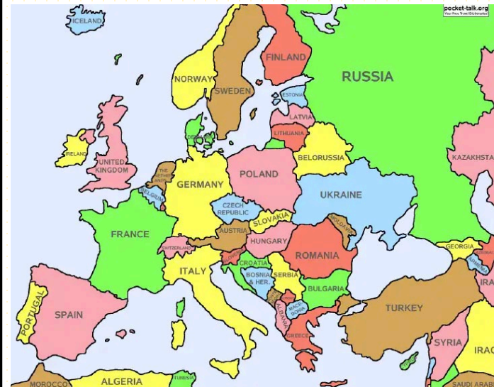
Map of Europe