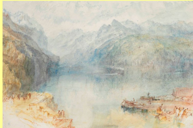
The Lake Lucerne from Brunnen with a Steamer