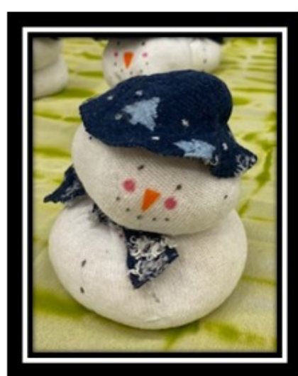
Class 3 Enterprise Stall Sock snowmen