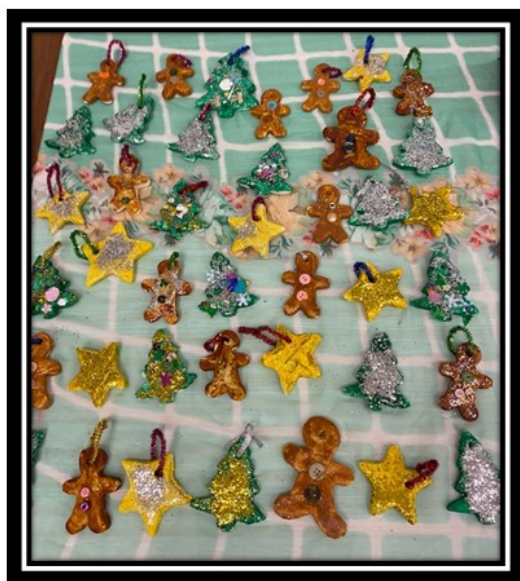
Nursery Class Enterprise Stall Salt dough tree decorations